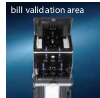
bill validation area

With the currency bill validators your operation will be more reliable and profitable.