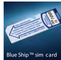
Blue Ship™ sim card